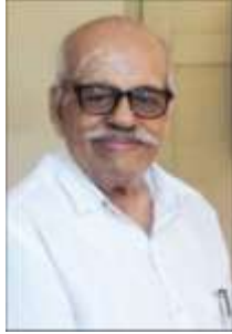
Figure 8: Prof. M. Sambasivan in 2016